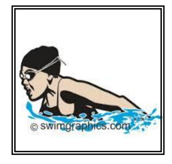
sw _ m _ er