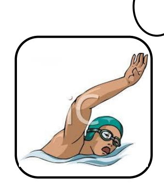
sw__ m__ er