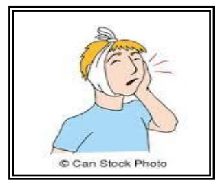
2) to _ tha _ he