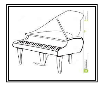
3) p _a _ o