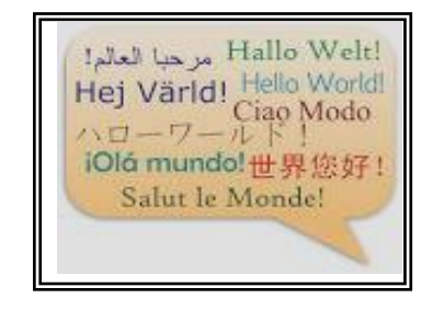
1) lan_u _ ges