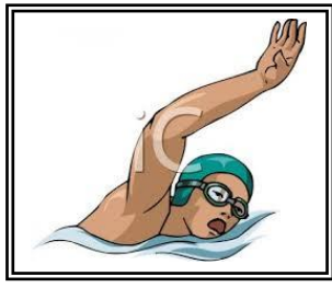
2) sw_ m _ er