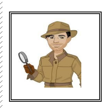
his _ ori_ n