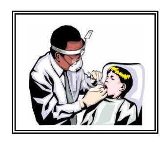
4) d _ nti _ t