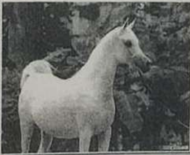
(big – horse )

With the helping of the following guide pictures and guide words write 2 sentences :- (2x3=6)