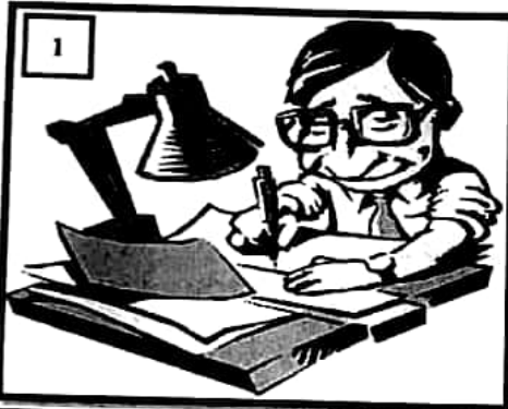
w r iter (U 6)

B) Fill in the missing letters ( 4 x 1= 4 marks ):-