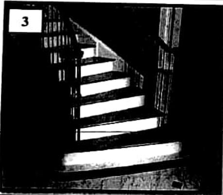
st a irs (U 3)