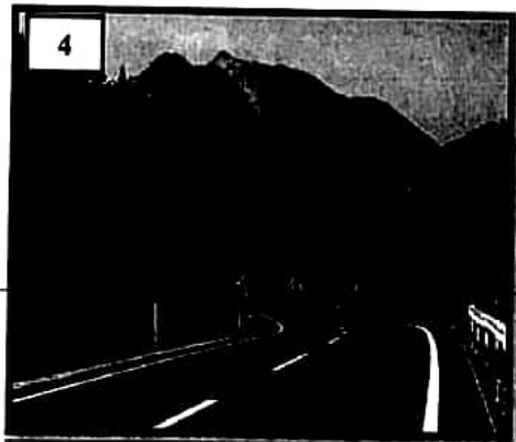
r o ad (U 4)